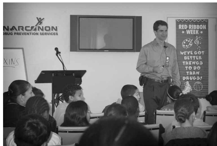
Narconon drug educator presenting to kids at the DEA Museum in New York City

As a public contribution, Narconon drug prevention presenters have been giving 45-minute talks to youth who tour the site. As a mother of two said, “This presentation has made a great impact. I really feel it is never too early to start speaking