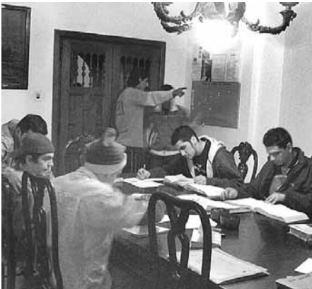
The Narconon Argentina life skills course room

"SINCE I WAS 12 YEARS OLD, I STARTED TO SINK MORE AND MORE BECAUSE OF DRUGS. MY MOTHER FOUND OUT ABOUT NARCONON ARGENTINA AND BY THAT TIME I WAS LIVING ON THE STREETS WITHOUT FOOD, MY GIRLFRIEND, OR KNOWING ANYTHING ABOUT MY DAUGHTER. ...NOW I SEE LIFE JUST THE WAY IT IS AND I CAN CONFRONT ANY SITUATIONS THAT CAN BE PRESENTED. ...I'VE DECIDED TO HELP OTHERS AND BECOME PART OF THIS ORGANIZATION. MY WIN IS TO BE WHO I REALLY AM."